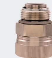
L-FS25 (Straight Swivel 1")